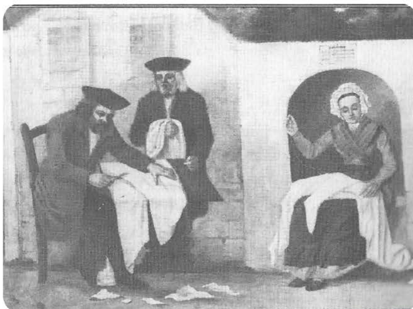
[Making the shroud Prague ca1780]

The practice of using tachrichim has a long history dating back to the second century of the Common Era when Rabbi Simeon ben Gamliel II asked to be buried in inexpensive linen garments after observing that some Jewish people were not burying their dead because they could not afford the burial. The custom of using tachrichim, and plain unadorned caskets, protects the poor from embarrassment at not being able to afford lavish burial clothes and ensures that all are equal in death.